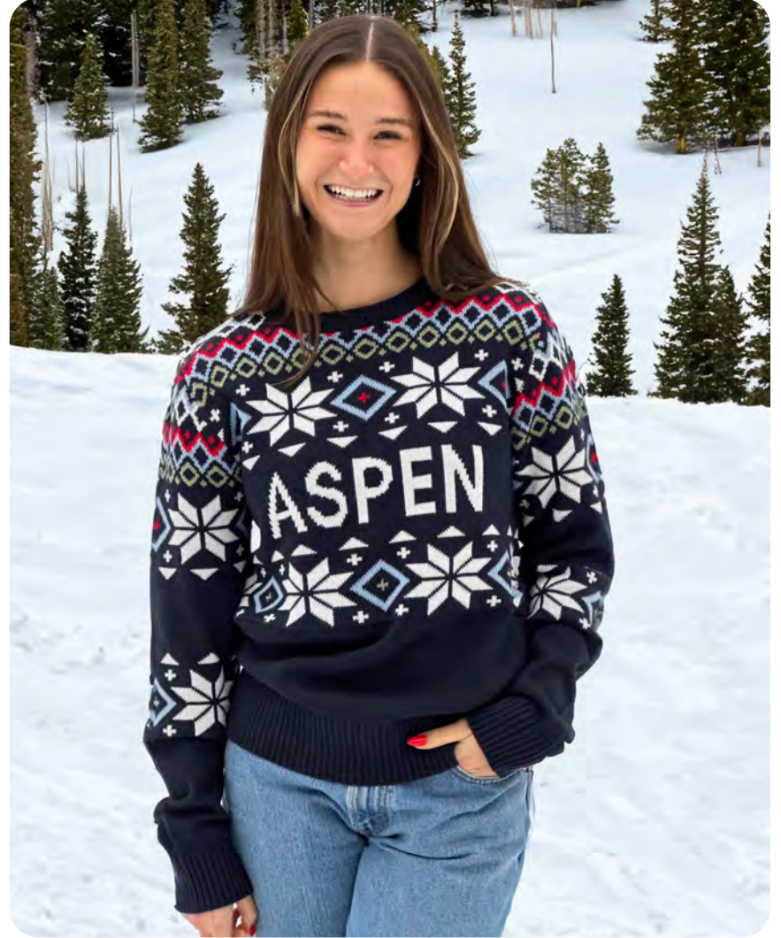
Features: Long sleeve crew neck sweater with all over fair isle pattern and custom wordmark.