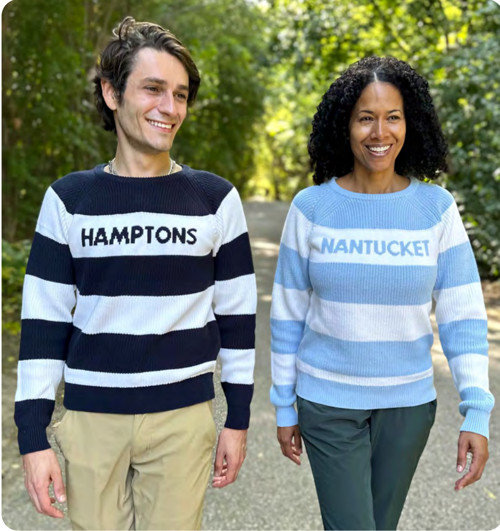
Features: Fisher knit rib, crew neck, long raglan sleeves, placement stripes.