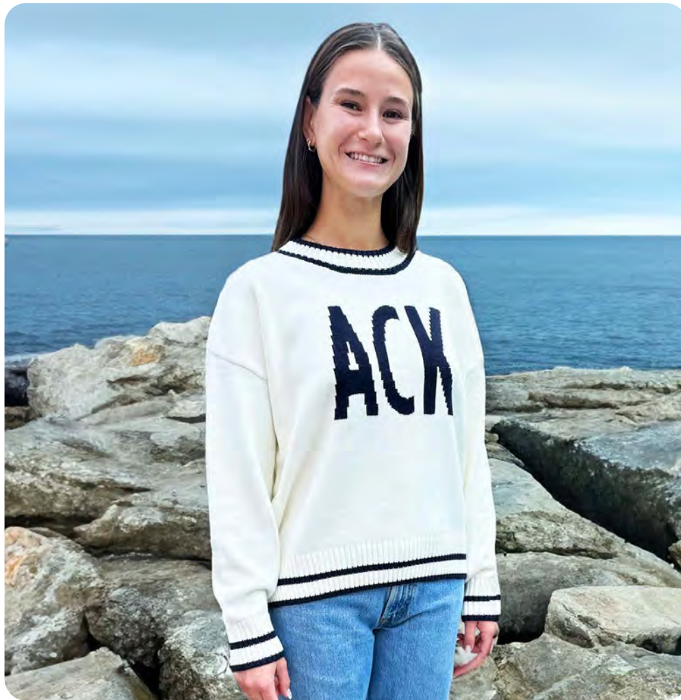
INLET TWS180 - Her Intarsia V Neck Sweater (7gg) 60% Cotton / 40% Acrylic