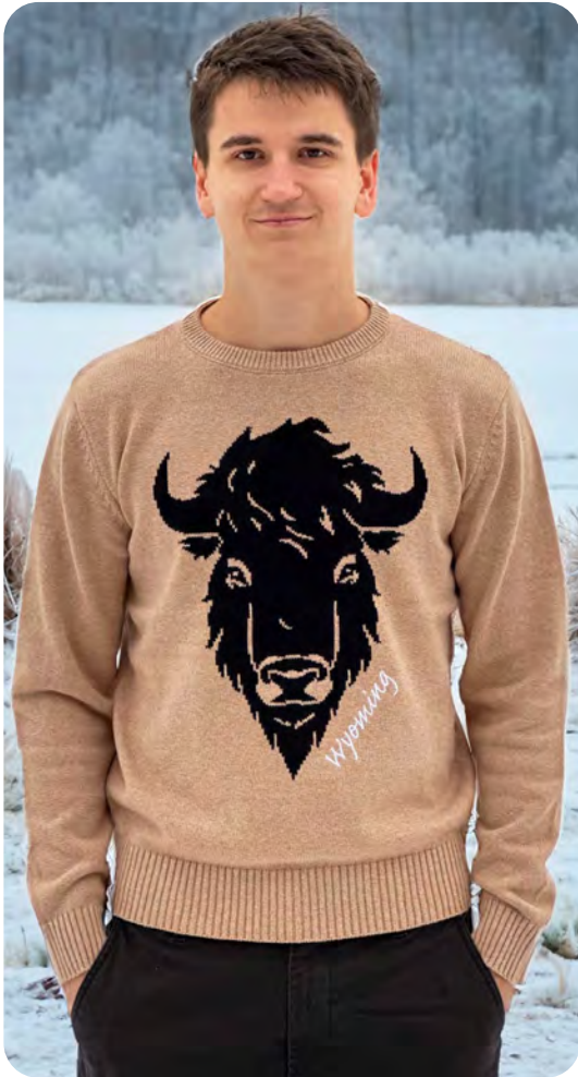
POINTER TUSW230 - Intarsia V Neck Sweater 100% Cotton