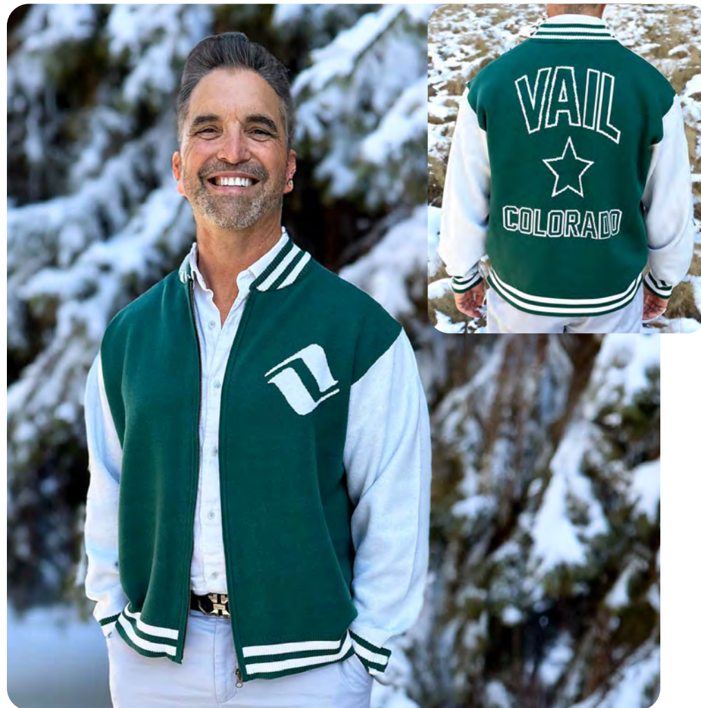
SWACKET TUKG355 - KNITTED Varsity Jacket 30% Polyester / 28% Acrylic / 21% Nylon / 21% Viscose

Features: Customize your own knitted Varsity Jacket with JACQUARD! Long sleeve, outer pockets, contrast stripes and sleeves (or allover solid), full zip front closure.